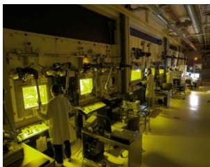
Post-Irradiation Exams on Materials at LECI Hot-Laboratory

The LECI facility is mainly devoted to R&D development within French joint programs with industrial partners as EDF and AREVA. Nevertheless this laboratory is able to welcome foreign scientists and engineers in other scientific and technical areas, such as the development of new hot cell equipment, fundamental or academic research topics and experimental devices required to perform PIE on material.