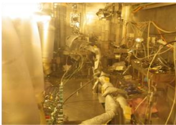
Post Irradiation Examns of fuel at LECA Hot-Laboratory

The LECA-STAR facility is mainly devoted to R&D development within French joint programs with industrial partners as EDF and AREVA. Nevertheless this laboratory is able to welcome foreign scientists and engineers in other scientific and technical areas, such as the development of new hot cell equipment, fundamental or academic research topics and safety tests required to perform PIE conducted within the framework of International collaboration.