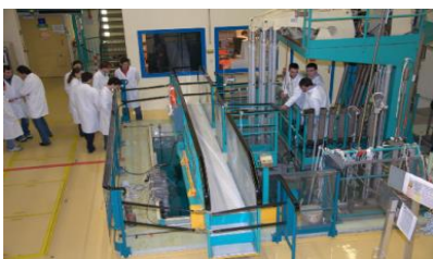
ISIS Education & Training Research Reactor

Thus, further development of the education and training activity could easily be achieved within the ICERR.