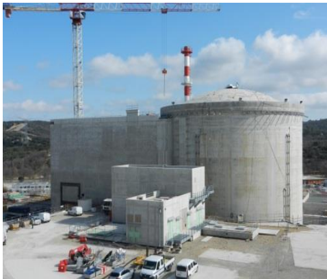
JHR Building site- Mid 2017

To prepare the future JHR scientific community, CEA has started five years ago a “Secondee program” welcoming scientists, engineers in the CEA team to prepare the first experimental capacity. Up to now more than 20 Secondees from various countries have participated to this program. This hosting possibility within JHR team will be enhanced using the recent ICERR designation.