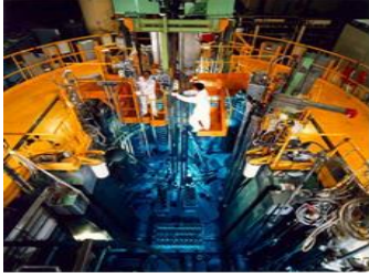
ORPHEE neutron beam research reactor.